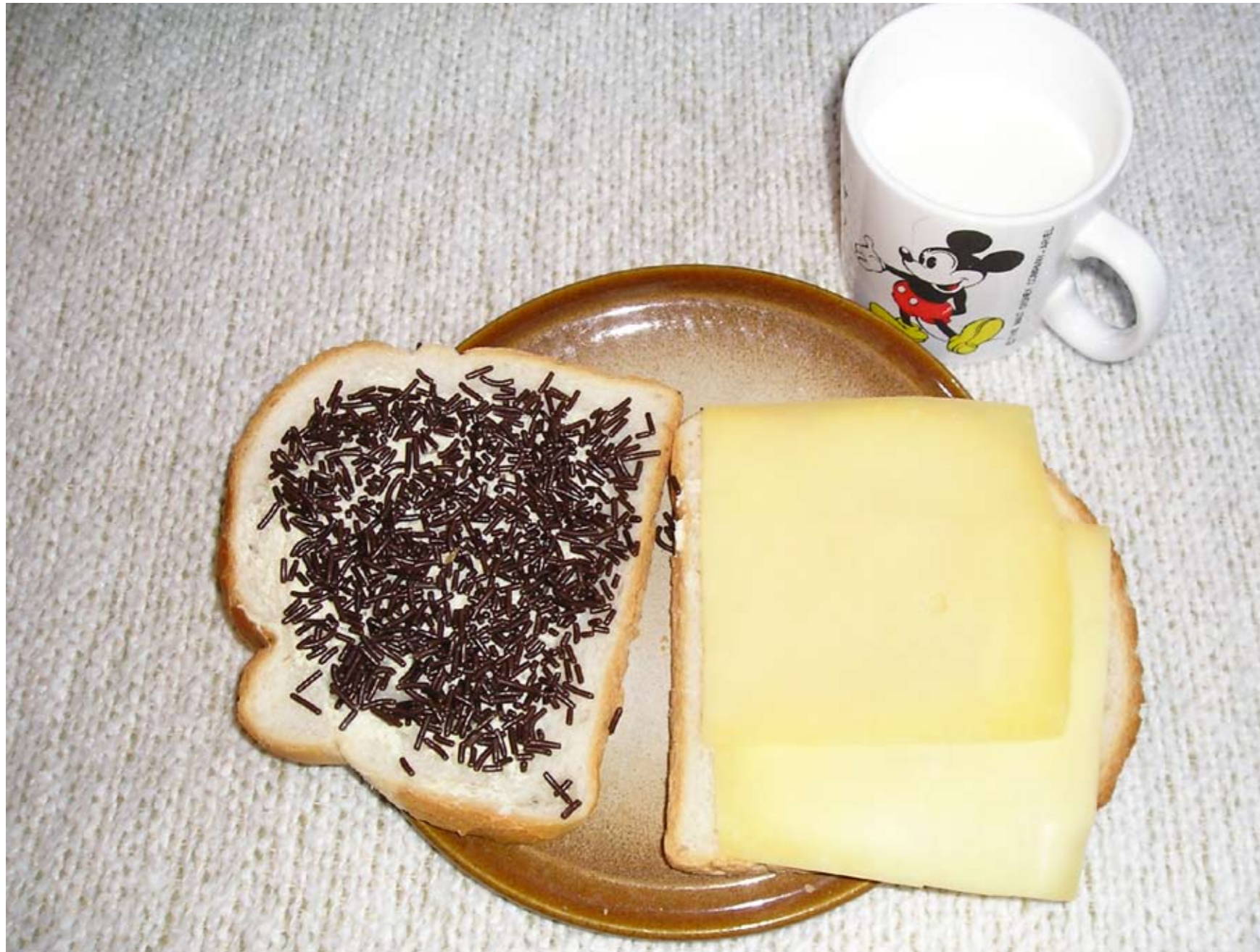
Breakfast in Holland with milk and bread. On the left sandwich a topping of “hagelslag”, this is made of chocolate. The right sandwich is with cheese on it.