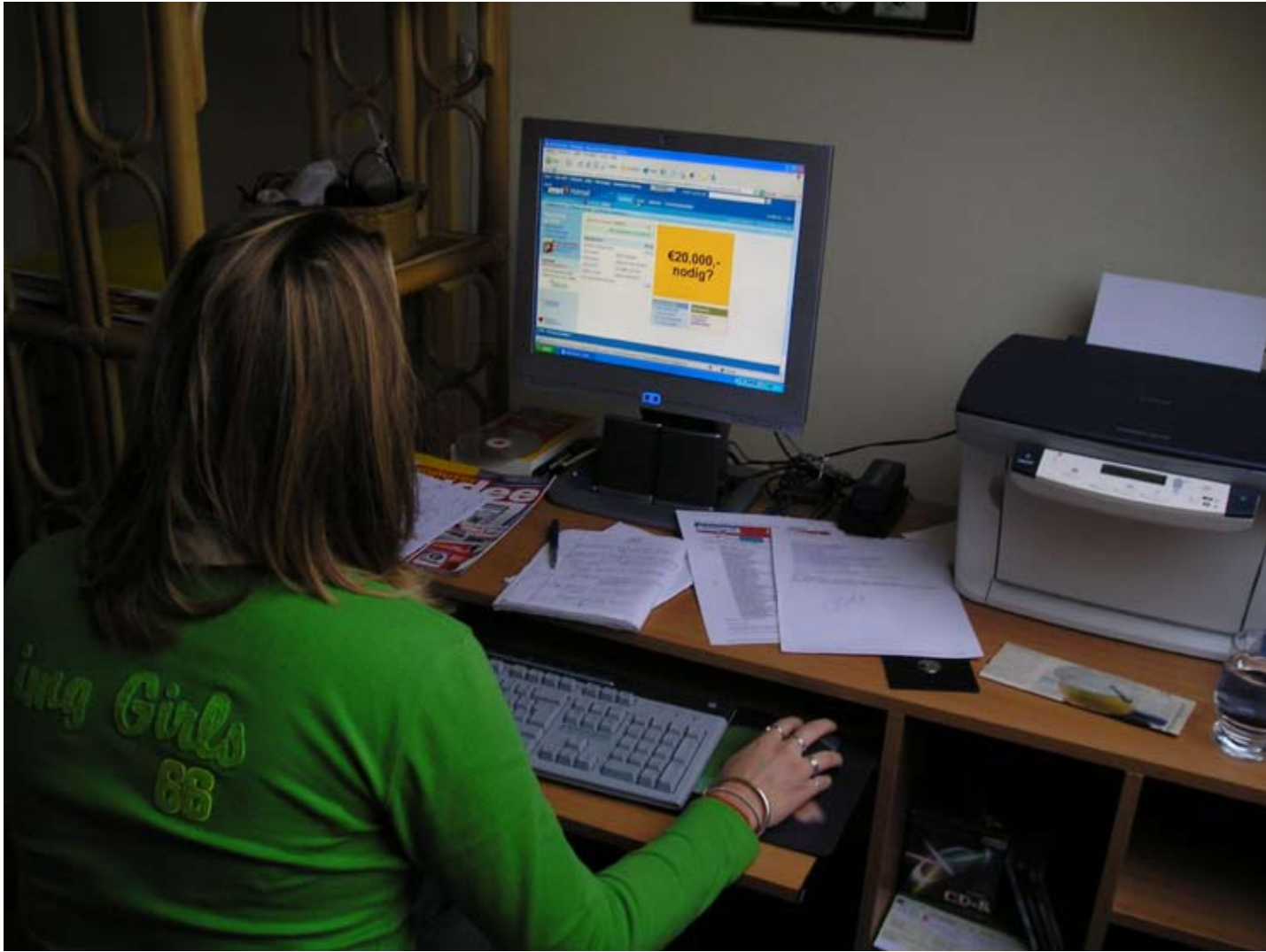
Almost every family has a personal computer.