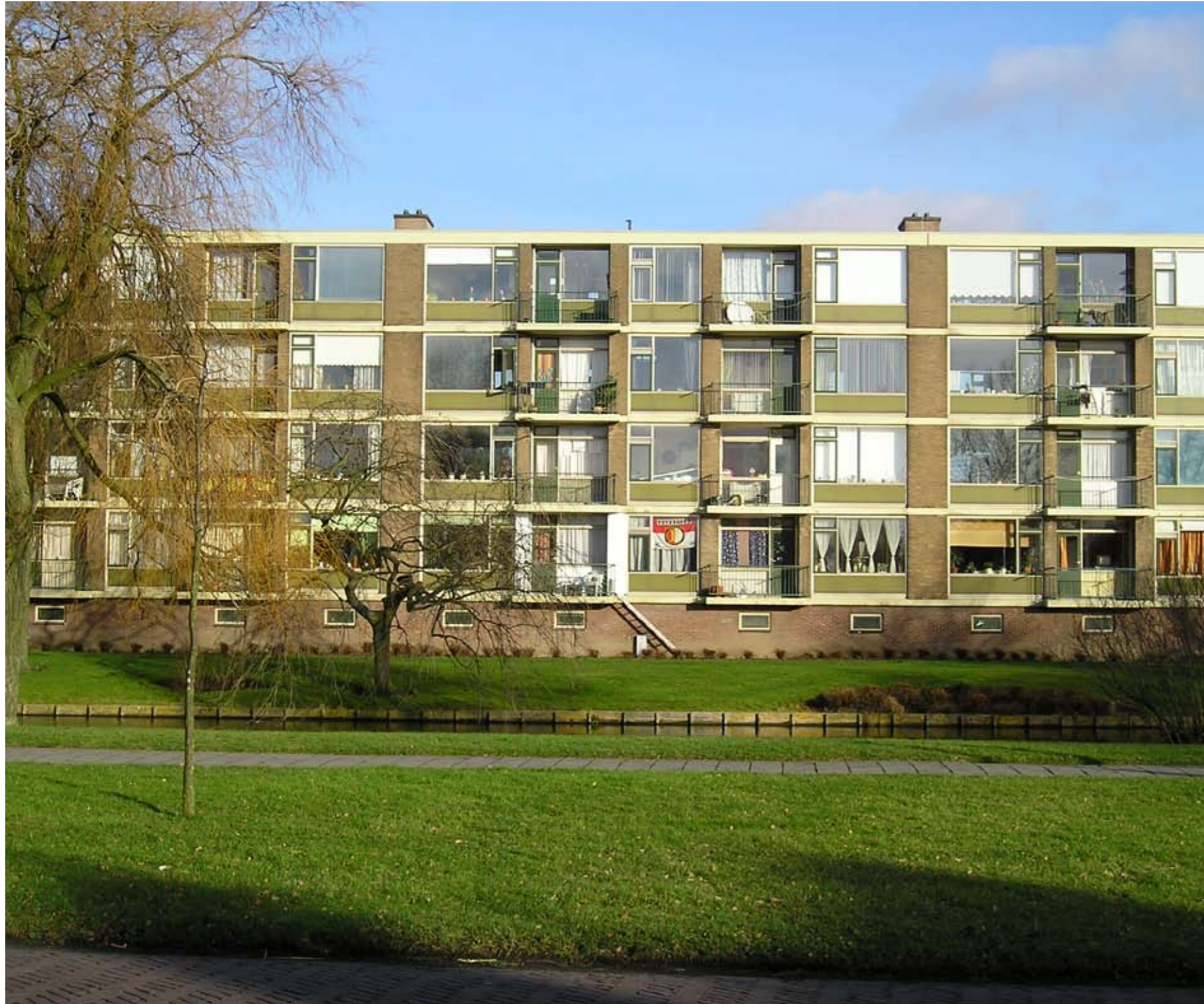
There are also many block of flats in Holland.