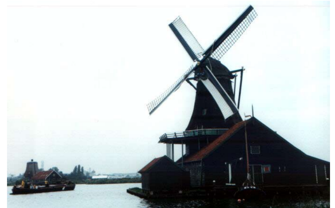
Windmill with shed.