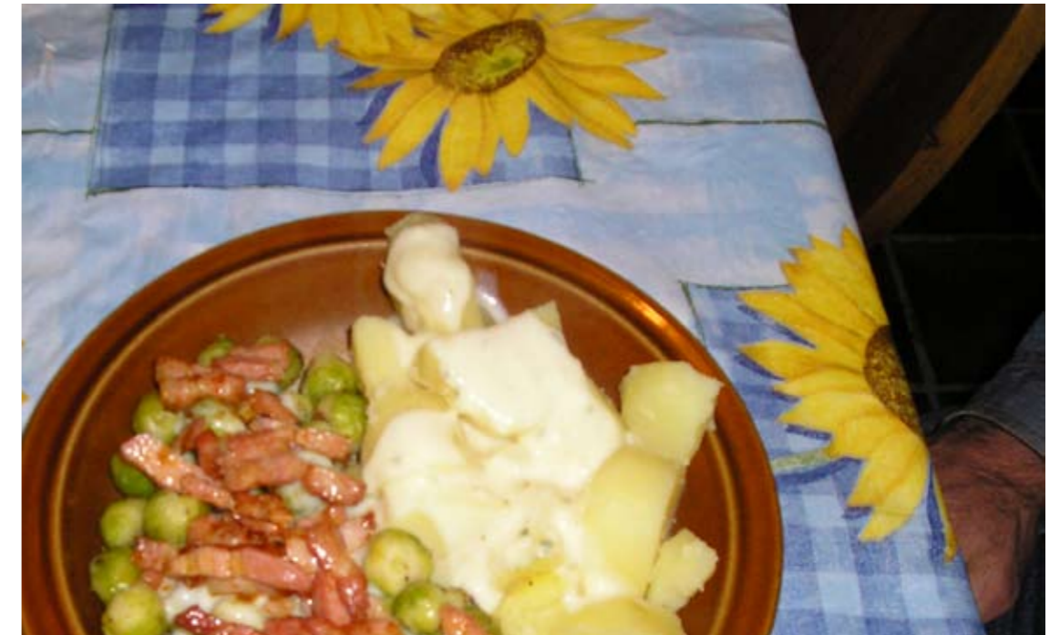
Dinner with potatoes, bacon and vegetables.