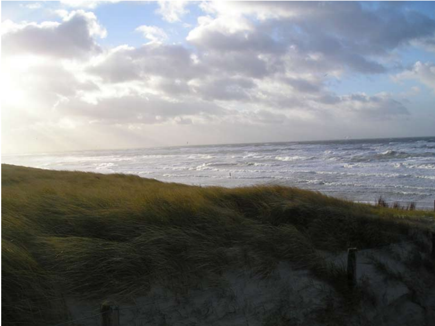
The North Sea.