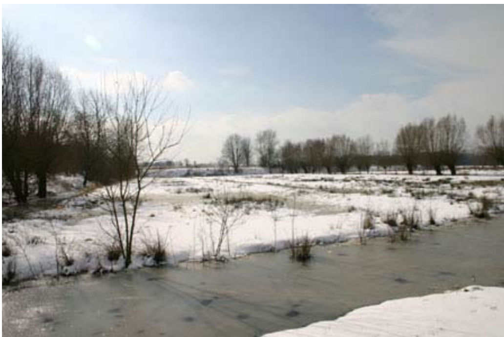
Landscape in winter.