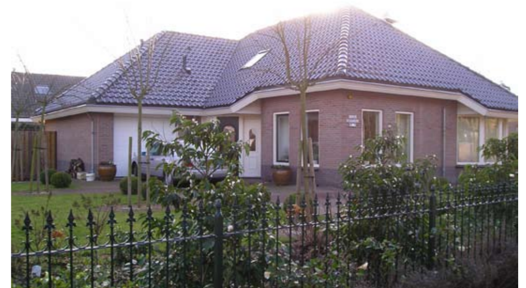
This is a villa for rich people.