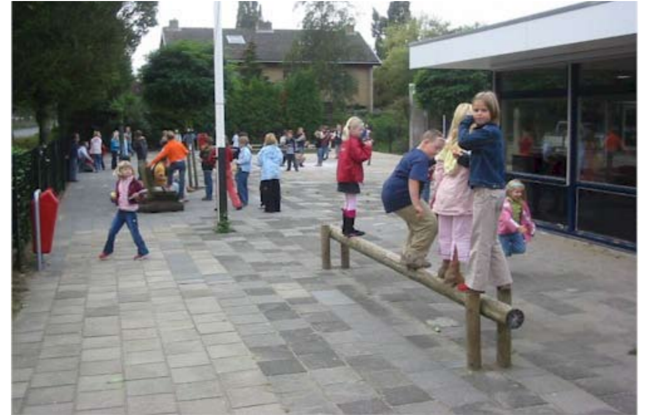
Schoolyard in the break.