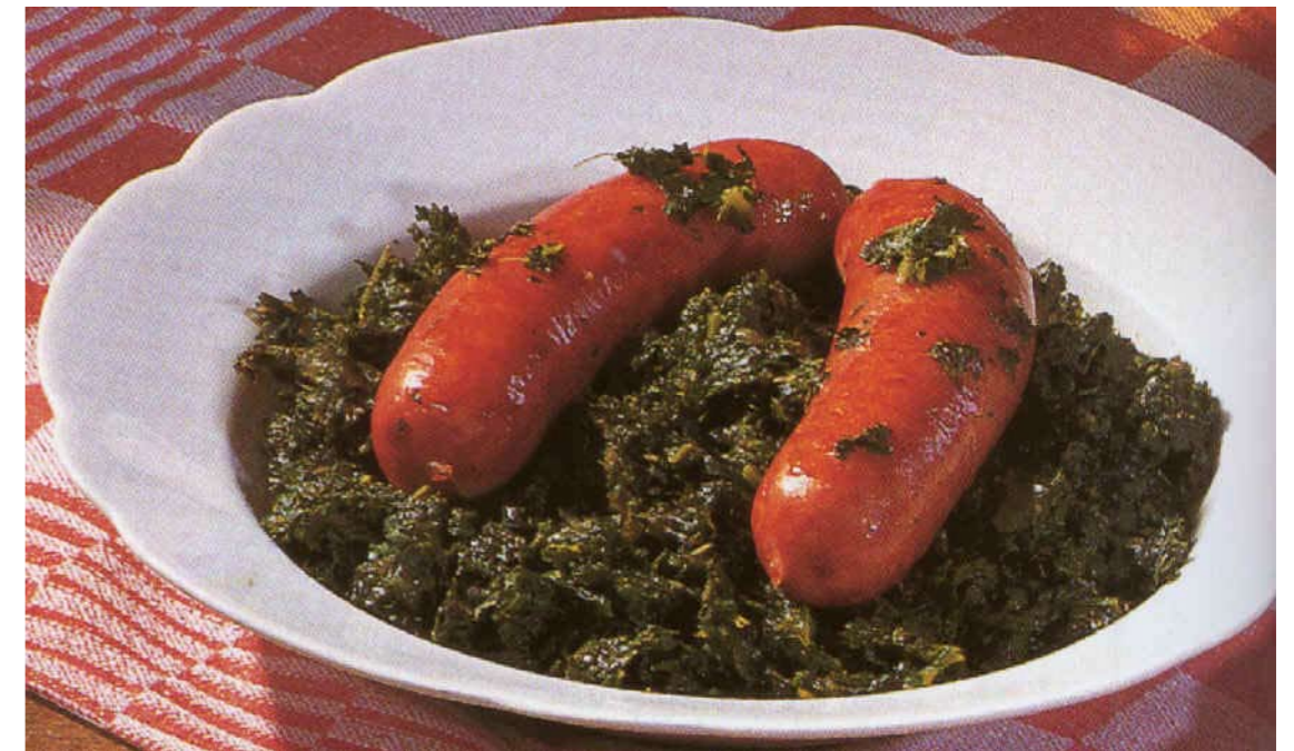
Dinner with vegetables and a big sausage.