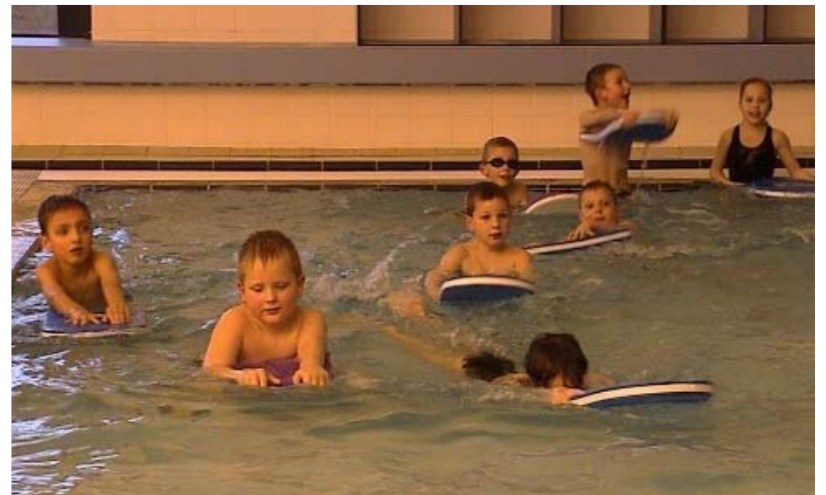
Swimmingpool with children.