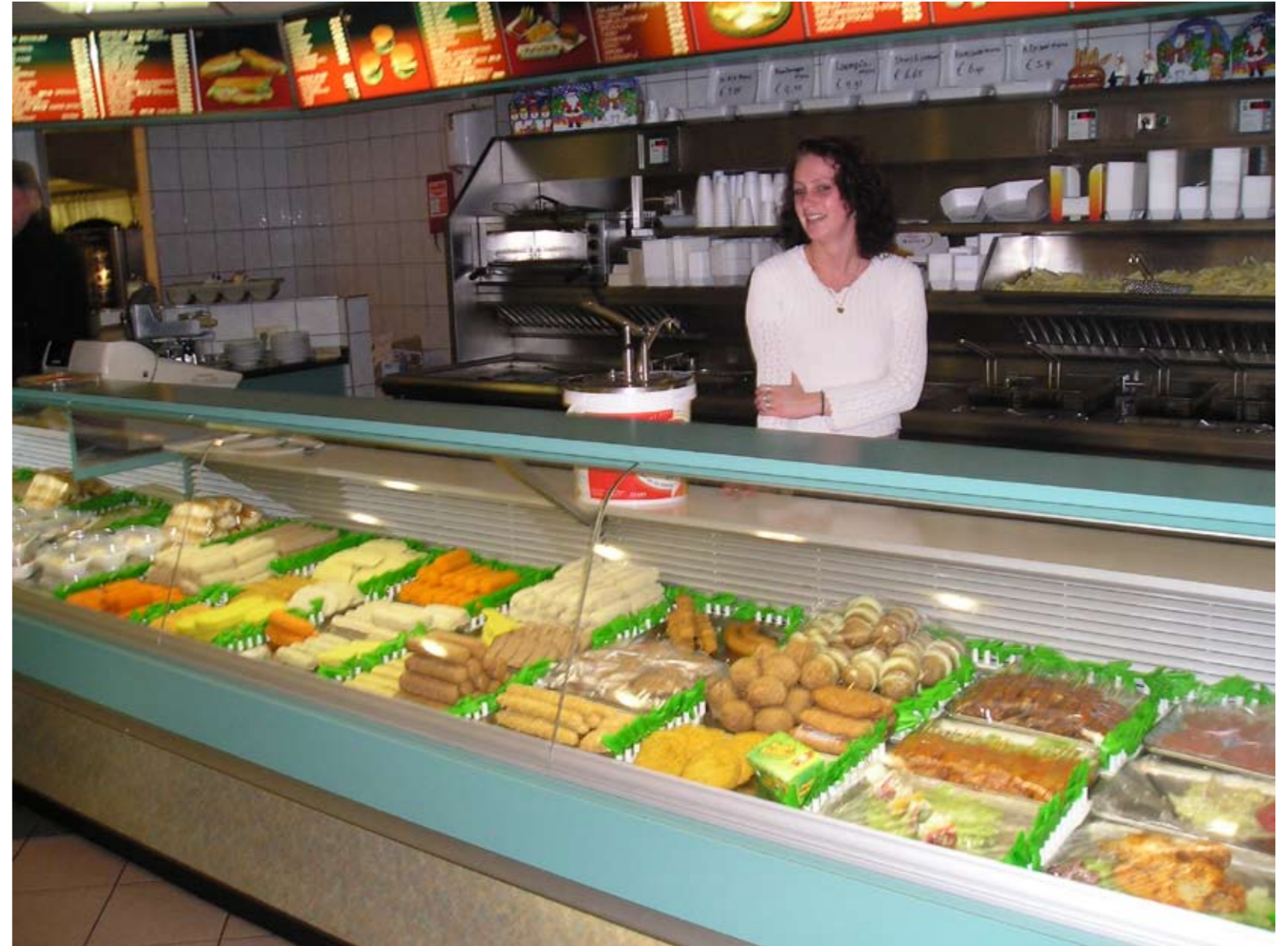
Snackbar with hamburgers, french frites and other snacks.