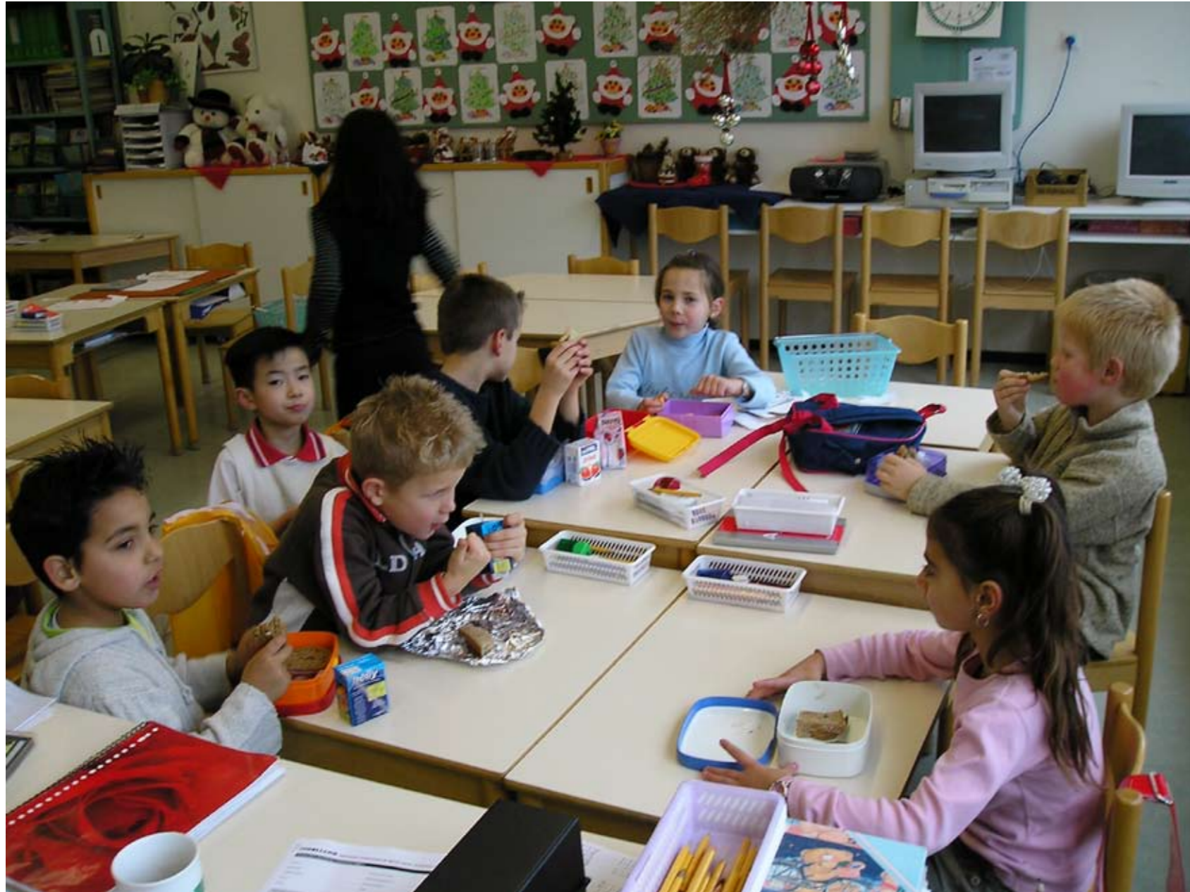
Children eating in the classroom.