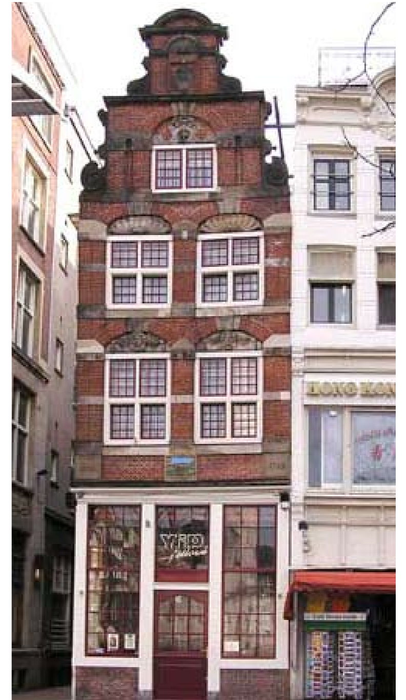
This is an example of an old step gable house.