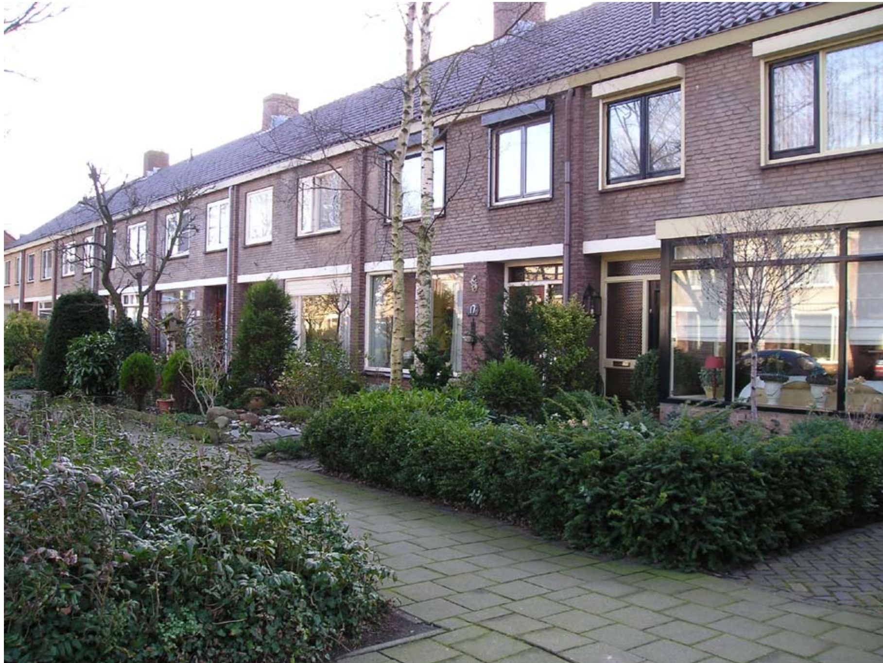
Most of the people in Holland live in these terraced houses.