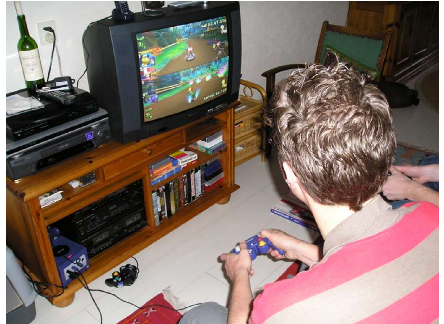
This boy is playing a computer game with his friend. Most of the children in Holland are doing the same in their spare time.