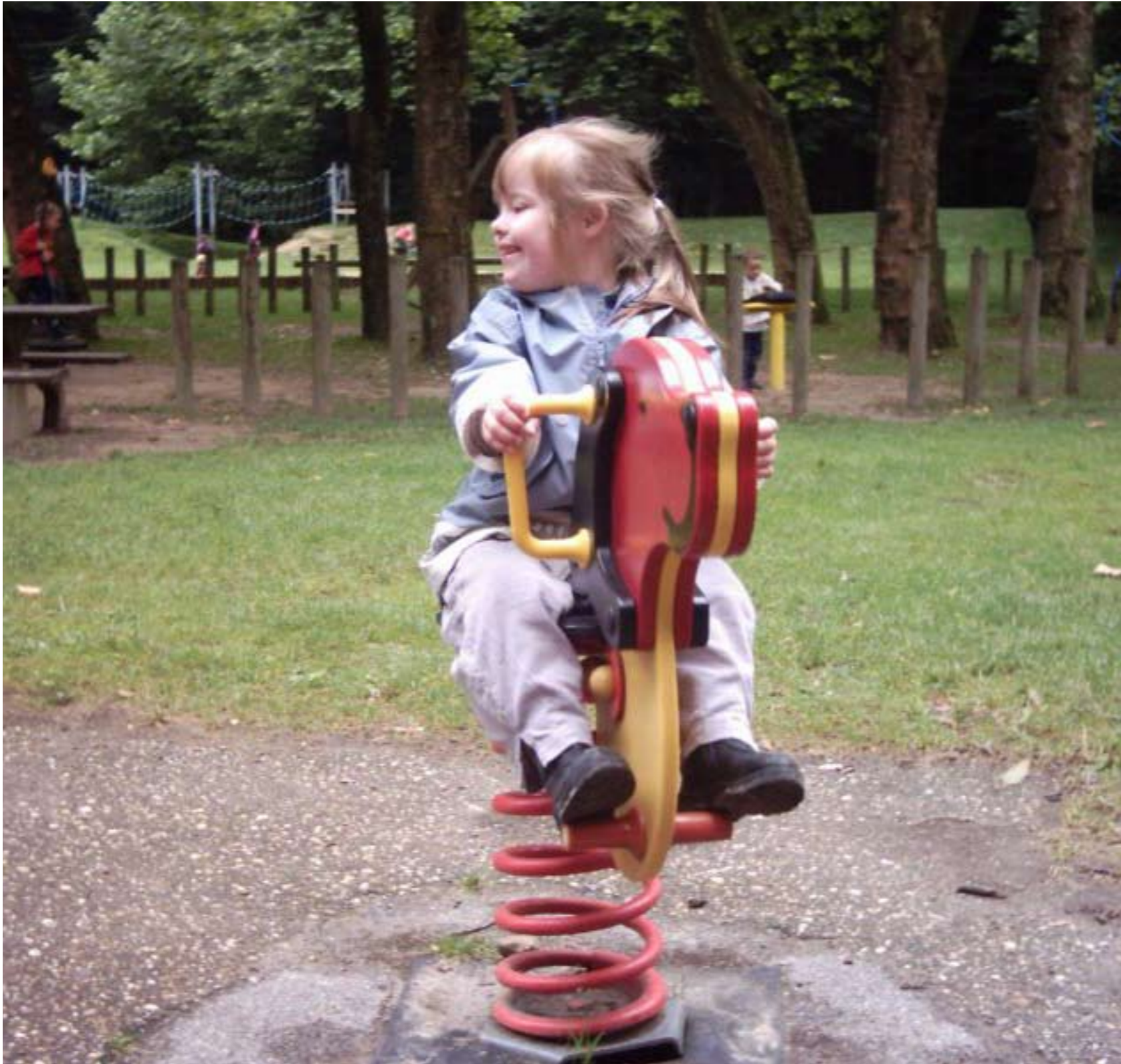
A girl playing in a playground.