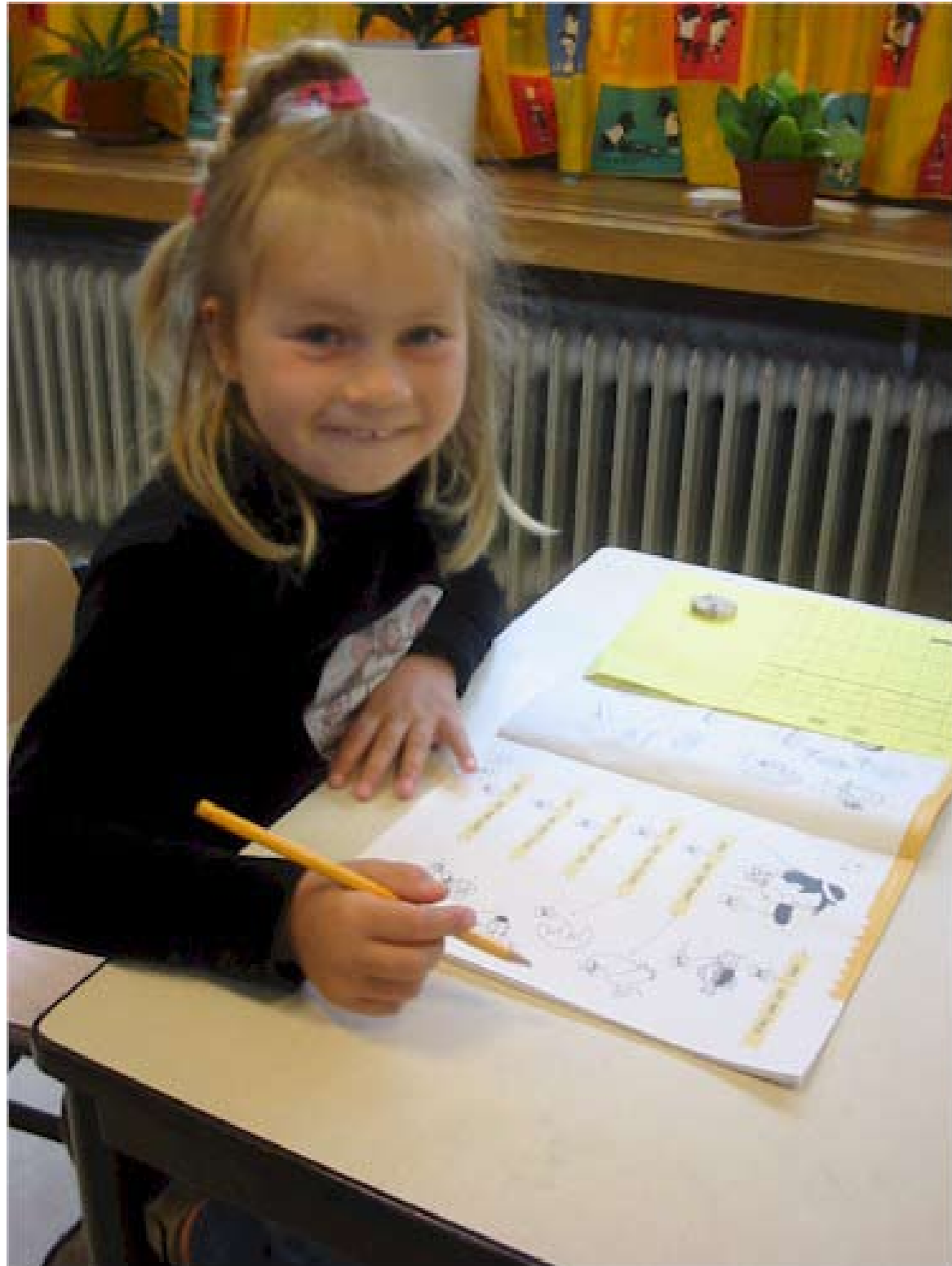
Learning the Dutch language.