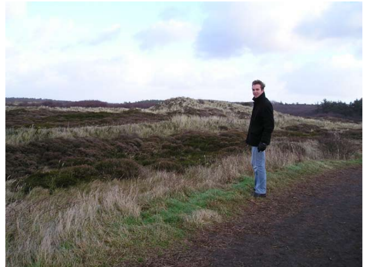
Dunes on the coast.